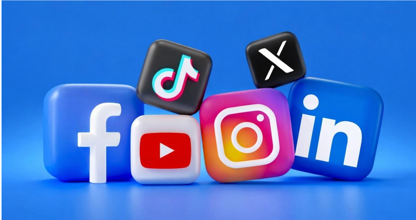
modified by AI